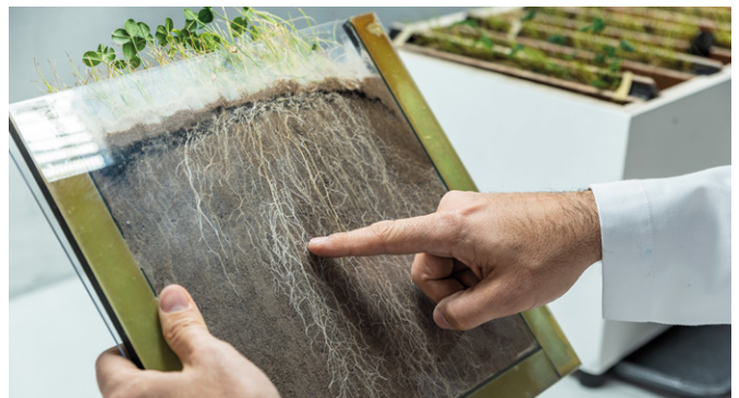
Grass. In-house rhizotron trials. 2019.