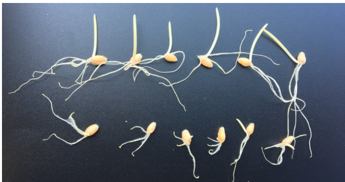
Wheat. In-house germination trials. 2019.